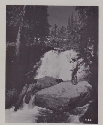
Some 200 miles of trout streams are to be found within a short drive of Creede. The area has long been known for its good fishing. — 44 —