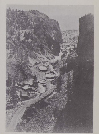
This dramatic view down Willow Creek Canyon shows Upper Creede, String Town, and then, at the mouth of the canyon, Creede itself. The camp was strung out for over two miles, and in some places it was only about 100 feet wide.