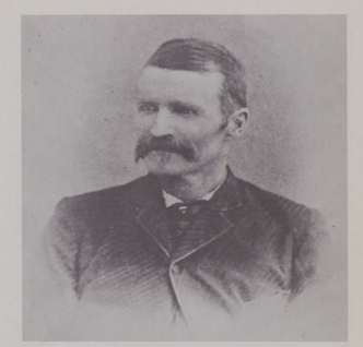
NICHOLAS C. CREEDE

Creede's strike on Willow Creek in 1889 started the last of the big silver booms. First called Willow, the camp was renamed for Creede in 1890 and officially incorporated into a city on March 19, 1892.