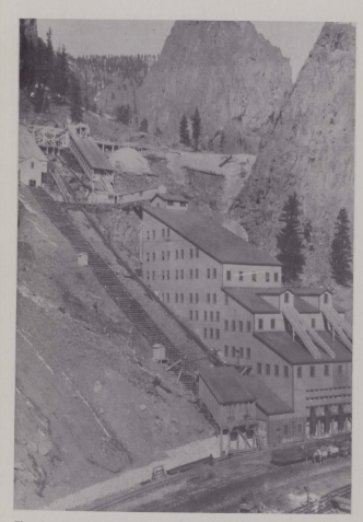
The giant Humphery Mill. Raw ore went in at the top and gravity carried it down through the refining processes. — 32 —