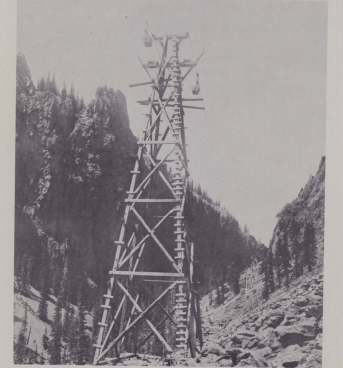
The ore from the fabulous Amethyst mine was brought down West Willow Creek gorge over this high tram system.